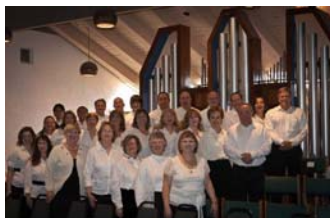
The Wesleyan (Adult)