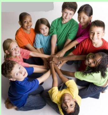
Children's Sunday School