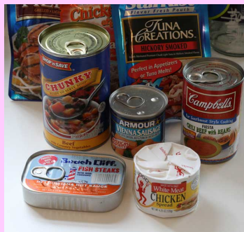
Canned meats and soups